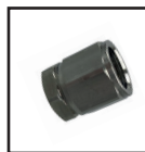
3/8" BSP Nut + Liner