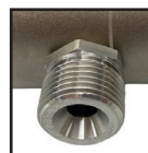
3/8" BSP THREADED THERAPY CONNECTOR