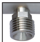
9/16" THREADED THERAPY CONNECTOR